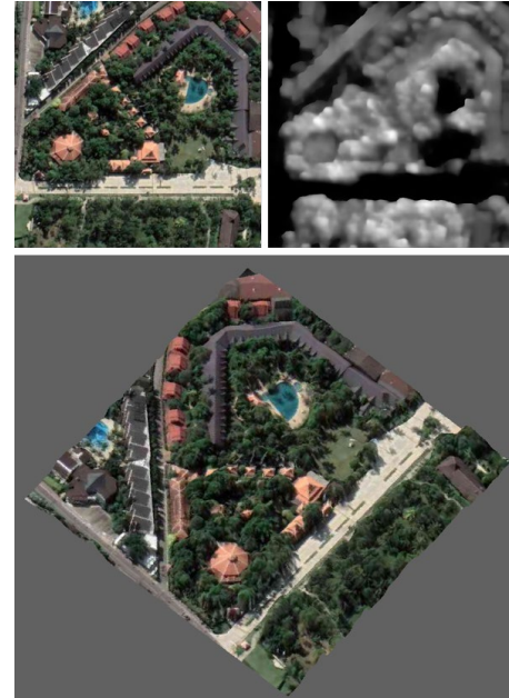
Fig. 2. Top: From left to right: remote sensing image, height map from height adaptive loss function. Bottom: 3D map reconstruction from adaptive loss function

Fig.1 presents an example of comparing height loss function[4] and adaptive height loss function results by reconstructing 3D map from google earth cropped image, Jacksonville area in the United States. We observe that our reconstruction result presents less noise and succeeds in extracting the outlines of the high elevation buildings.